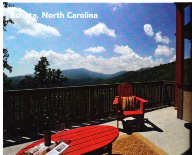
Echota, North Carolina