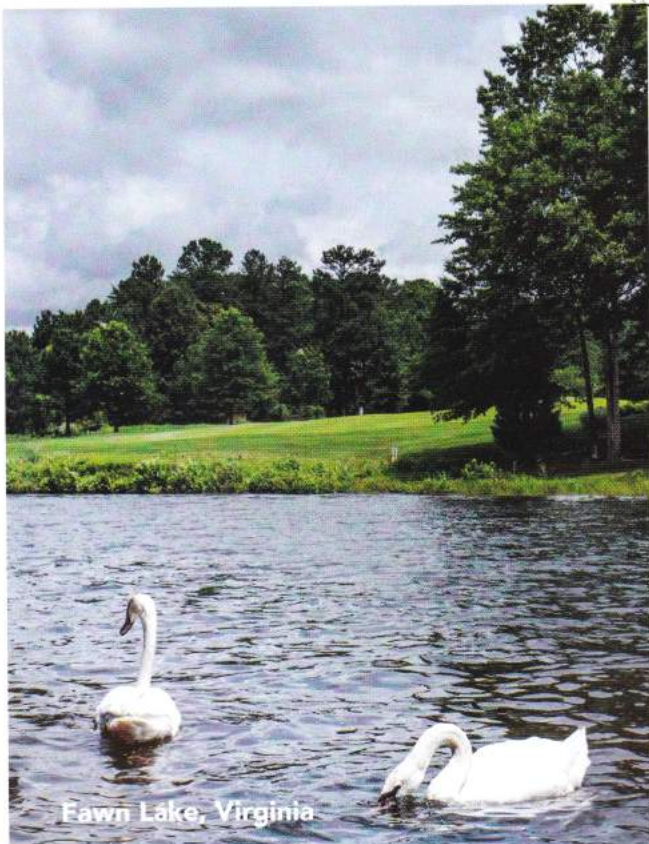
Fawn Lake, Virginia