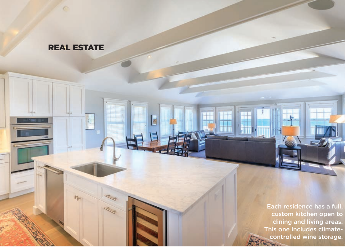
Each residence has a full, custom kitchen open to dining and living areas. This one includes climate-controlled wine storage.