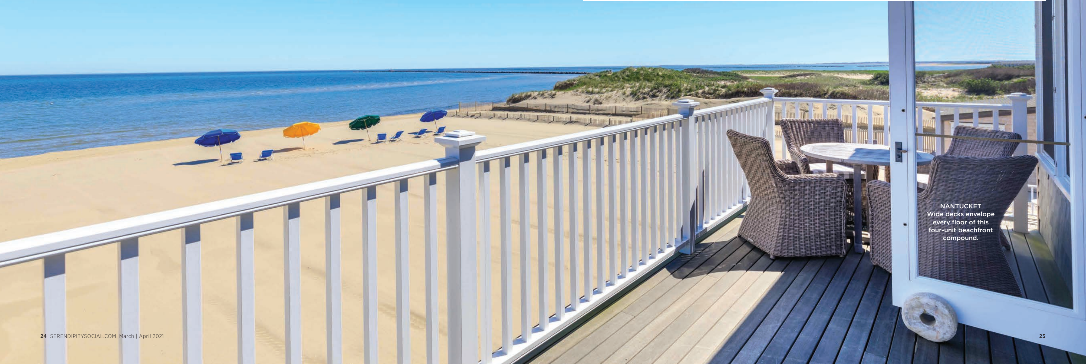
NANTUCKET Wide decks envelope every floor of this four-unit beachfront compound.