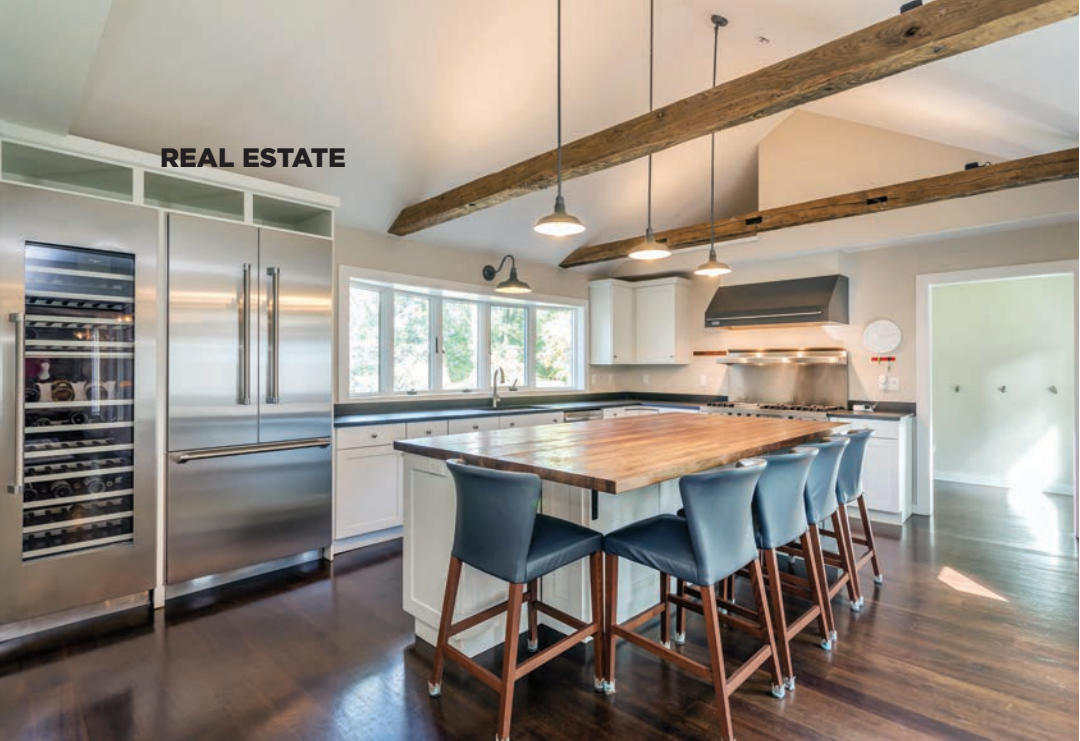
BRIDGEWATER (top) The large kitchen is ideal for hosting family and friends. (center) A heated gunite pool has breathtaking views of the surrounding hillside. (bottom) One-third of a mile of lakefront provides easy access to Lake Lillinonah.