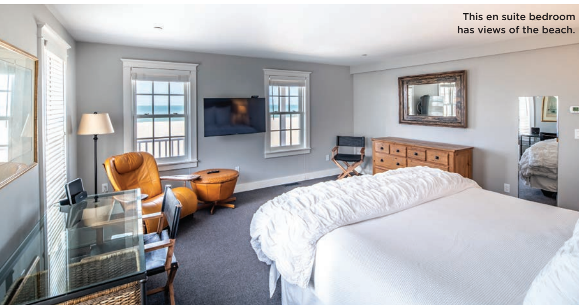
This en suite bedroom has views of the beach.