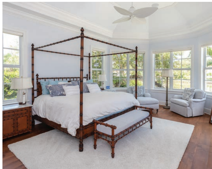
JOHN'S ISLAND (top) A fireplace, built-in bookshelves and floor-to-ceiling windows are touches of refinement. (center) High ceilings and large windows bring lots of natural light into the serene master bedroom. (below) A one-story layout and dock access to the lagoon appeal to today's buyers.