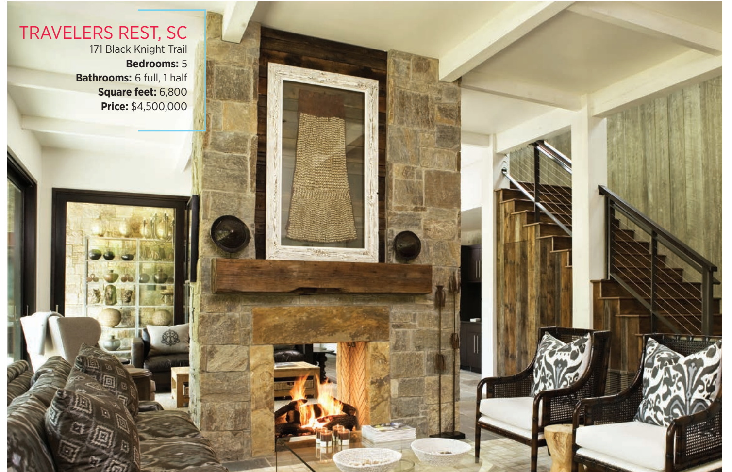
(above) A two-sided fireplace is wood and gas burning, and one of four throughout the house. (below) A cozy nook perfect for reading.

171 Black Knight Trail Bedrooms: 5 Bathrooms: 6 full, 1 half Square feet: 6,800 Price: $4,500,000