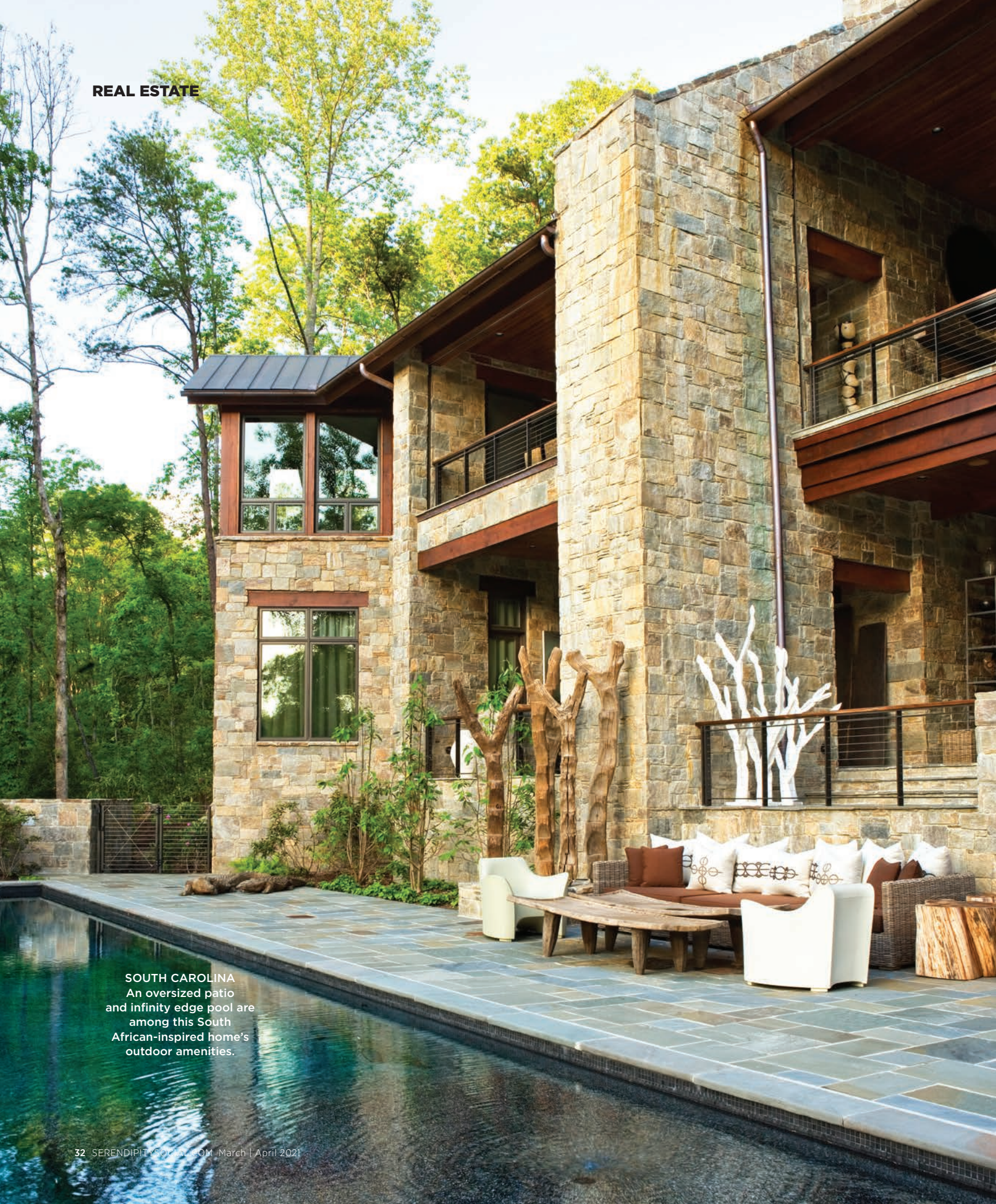
SOUTH CAROLINA An oversized patio and infinity edge pool are among this South African-inspired home's outdoor amenities.