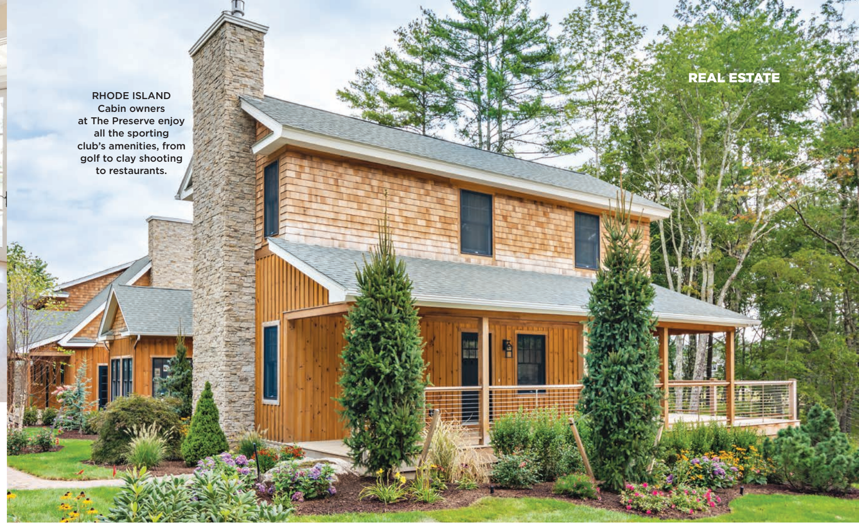
RHODE ISLAND Cabin owners at The Preserve enjoy all the sporting club's amenities, from golf to clay shooting to restaurants.

Cozy up by the stone fireplace of this cabin or step out for a hike to a nearby waterfall or flyfishing pond as a resident of Laurel Ridge, a spacious home at The Preserve Sporting Club & Residences in Rhode Island, a luxurious community just 25 minutes from Providence.