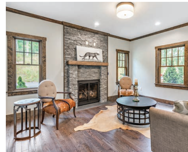
Wide-plank floors and stone fireplaces are among the cabin's fine finishes.

Bedrooms: 2 Bathrooms: 3 full, 1 half Square feet: 2,543 Price: Starting at $2,149,000, including annual membership for amenities