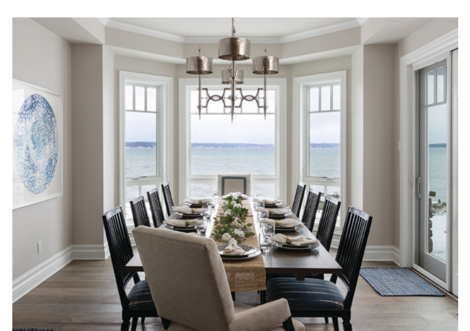
CLOCKWISE FROM TOP LEFT: THE LIVING AREA REFLECTS THE HOME'S VIBRANT COLOR SCHEME; EXTERIOR VIEW; THE KITCHEN: THE DINING ROOM WITH STRIKING VIEWS OF NORTHERN MICHIGAN'S TORCH LAKE.

OPPOSITE PAGE, CLOCKWISE FROM TOP LEFT: A FUN-FILLED GRANDCHILDREN'S BEDROOM; THE GUESTHOUSE BOASTS LIVING SPACE AND TWO BEDROOMS; A BEDROOM WITH LAKE VIEWS; THE WINE ROOM ON THE LOWER LEVEL.