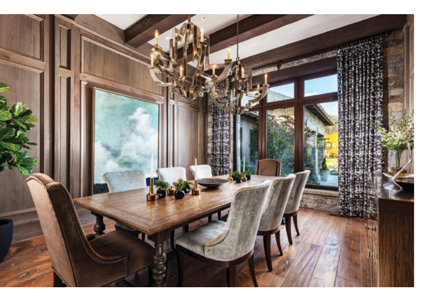
CLOCKWISE FROM TOP LEFT: THE EXTERIOR FRONT OF THE MOUNTAIN RETREAT; THE EXPANSIVE KITCHEN; THE THIRD BEDROOM FEATURES SOFT TOUCHES TO COUNTER THE MASCULINE BACKGROUND; THE DINING ROOM BOASTS A UNIQUE CHANDELIER; THE GREAT ROOM AND BAR ARE FULL OF WARM AND WELCOMING DETAILS THAT REFLECT THE PERSONALITIES OF THE OWNERS.