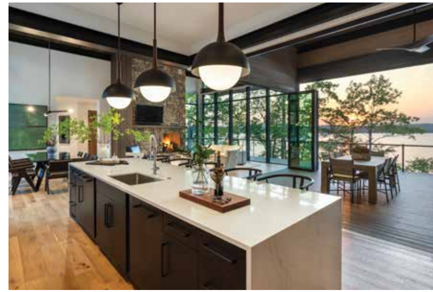
Clockwise from opposite: Streamlined furnishings in the dining room echo the home’s modern aesthetic. A glass-topped table pairs impeccably with sleek dining chairs and a Regina Andrew chandelier. A black-and-white color scheme is a bold choice in the kitchen. Sub-Zero and Wolf appliances deliver high style and function. The kitchen connects seamlessly with the outdoor space outfitted with a dining table and chairs from Four Hands.