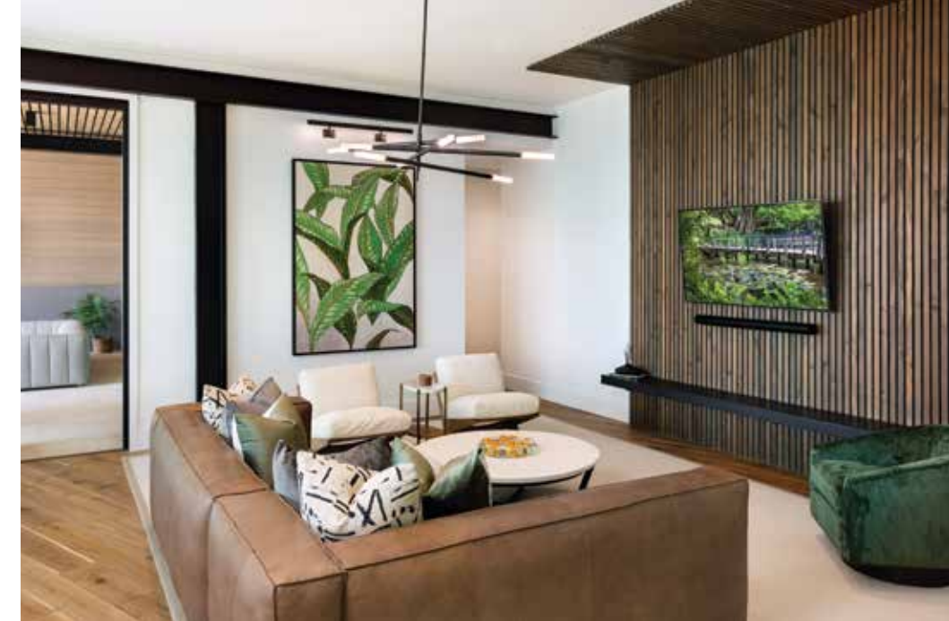
Clockwise from left: A lavish pool and spa area captures blissful views of Lake Keowee. Curvy lounge chairs from Four Hands balance the clean-lined pool design by Signature. The game room's viewing area features a slatted wood accent wall by The Cliffs Builders. The stylishly spare chandelier and sconce are from Visual Comfort. Counter stools complement the bar area adjacent to a game table from Arteriors and a ping-pong table from Ballard Designs.