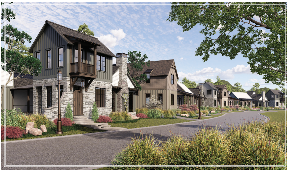
Rendering of streetscape at Cove Park at The Cliffs at Walnut Cove

The Cliffs at Walnut Cove gatehouse is located at 3 Cliffs Ridge Parkway, Arden. For more information, visit CliffsLiving.com .